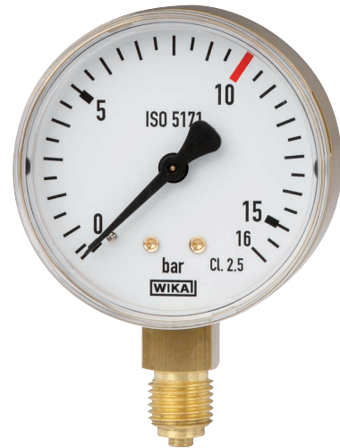
Bourdon tube pressure gauge model 111.11